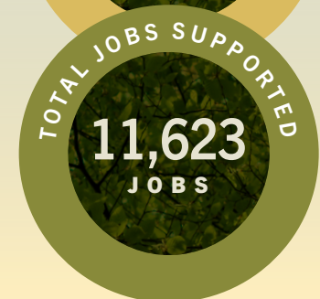
TOTAL JOBS BY SECTOR