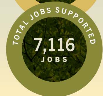
TOTAL JOBS BY SECTOR