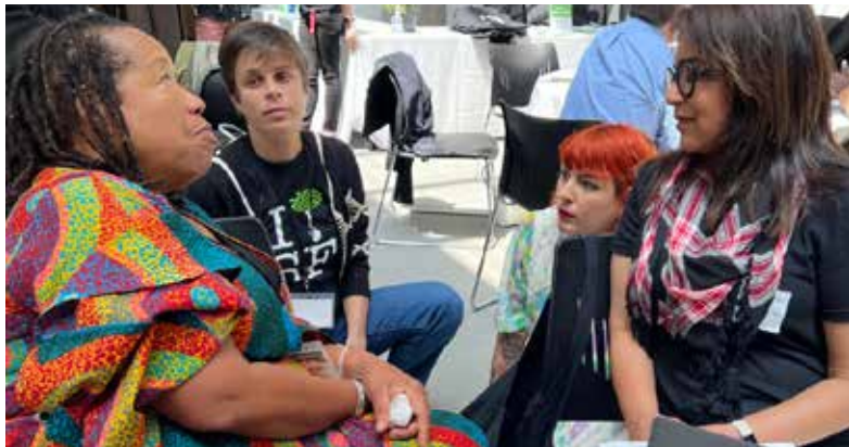
2023 Network Retreat

To support these grassroots efforts locally, California ReLeaf advocates for funding at the state level, seeks funding to support our large pass-through grant programs, and works with private sponsors to support our Growing Green Communities and California Arbor Week small grant programs.