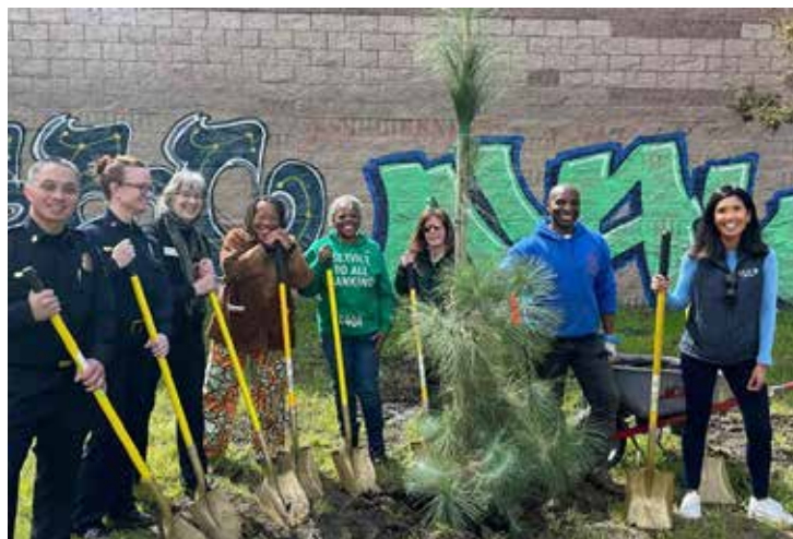
Arbor Week Press Conference in Oakland