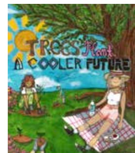
ARBOR WEEK POSTER CONTEST WINNERS