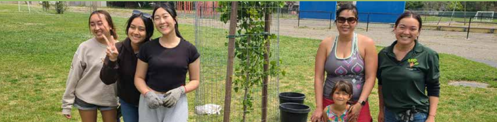
Your Children's Trees

Building community resilience against the impacts of climate change is vital. ReLeaf's pass-through grant programs support grassroots climate adaptation initiatives, with a focus on low-income and low-shade neighborhoods. With the rise of extreme heat events, the lack of shade trees in these communities poses health and safety risks. It is essential to prioritize tree planting and tree care projects in these areas. Trees can offer many benefits such as sequestering carbon, promoting the local economy, reducing violent crime, and improving public health, living conditions, and tourism.