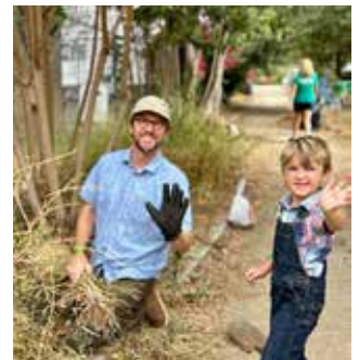
Save Our Forest