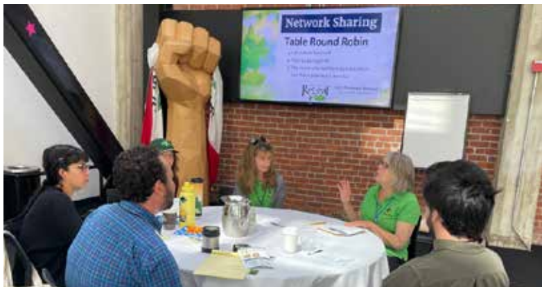
2023 Network Retreat