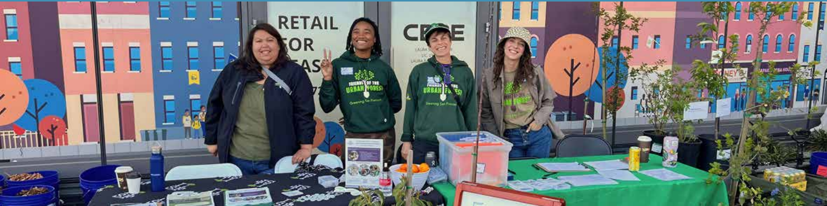
Friends of the Urban Forest

The California ReLeaf Network was hard at work in FY23, planting trees, engaging communities, providing jobs, and caring for their community forests. The collective impact of the Network can be felt across the state! Below are the numbers and stories shared by Network Members who completed our Network Impact Survey.