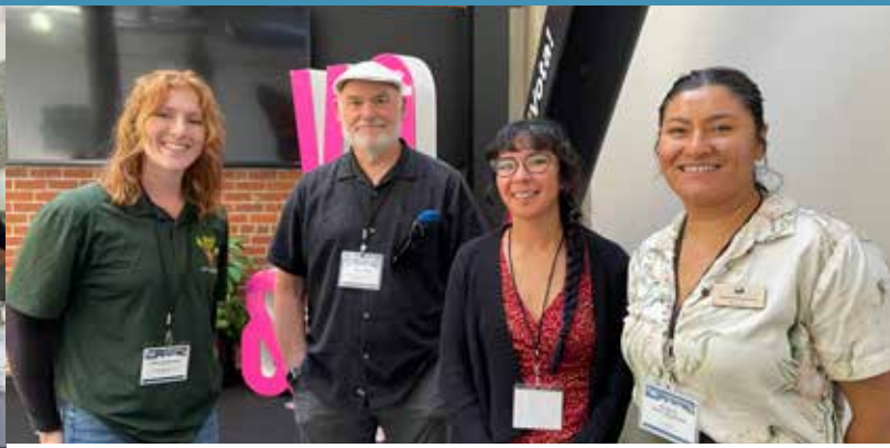
2023 Network Retreat

Since California ReLeaf's inception in 1989, we have worked to establish and support a coalition of community-based tree groups. Today, the California ReLeaf Network includes over 80 diverse tree nonprofits and community-based organizations all over California who share the vision and dedication to work locally to grow and care for tree canopy in their communities. As a Network, we are stronger together—our diverse experiences help us learn from each other. Through ReLeaf's peer-to-peer learning opportunities, like our educational webinars, Learn Over Lunch series, and our annual Retreat, the Network collaborates to share resources, best practices, successful programs and initiatives, and new innovative ideas to tackle new challenges.