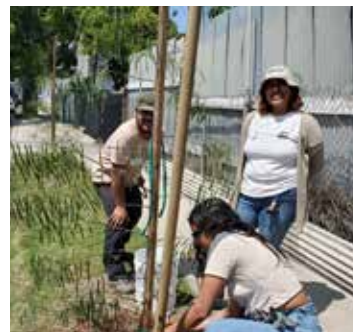
North East Trees