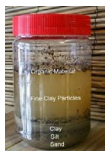
Bottom to top: sand, silt, clay, clay & water, organic mater.