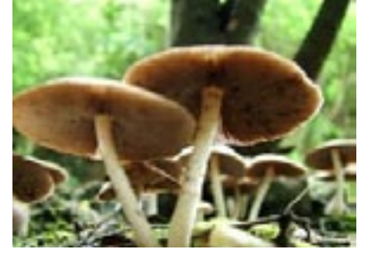
As you dig, do you notice anything around the root system that resemble Micorrhizae? They are like small white hairs that are growing in a mass. What is the soil like, compacted, loose, dark, light? Are there leaves and other decomposing matter? Do you see any mushrooms? Do you see anything that looks like mold or fungus under the ground? Do you think this soil is able to store water?