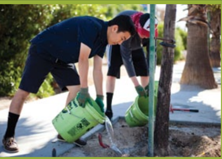
Above: A TreePeople volunteer cares for a street tree in North Hollywood.