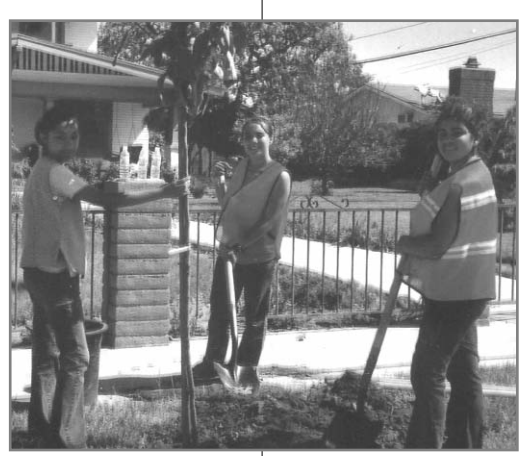
Members of Girl Scout Troop 688 help "green" Orange at a 2004 Arbor Day planting event.

"It has a very small town flavor to it and because of the pines you don't necessarily