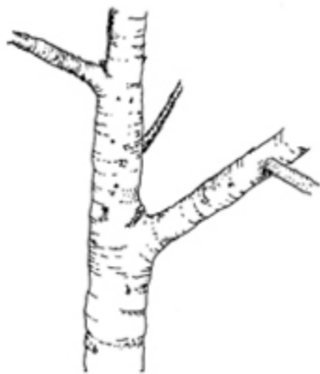
Figure 3. Reduce large branches (lower right); leave small branches intact.

Shorten or remove branches that are larger than half the trunk diameter at planting and every few years thereafter. Removing these branches helps create a strong tree because it shifts growth into the central leader. The central leader should be more visible in the crown center after pruning (Fig. 2). Shorten branches that are nearly as large as the central leader (Fig. 3, bottom right branch) because they compete with the leader and can be weakly attached. Smaller branches (Fig. 3, top) do not need pruning because they will not compete with the trunk.