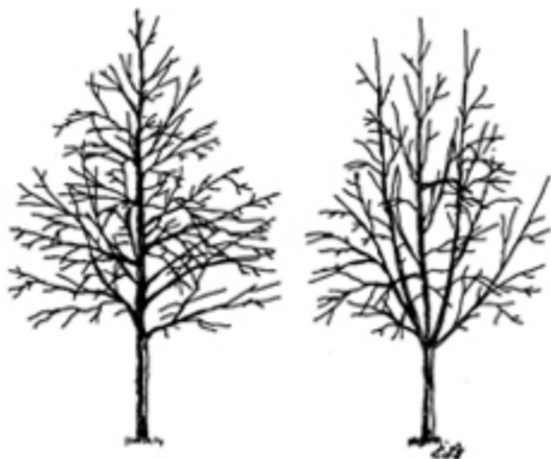
Figure 1. Good tree structure (left); poor structure (right).

Shade trees that grow to be large are more structurally sound and cost-effective to maintain when trained with a central dominant leader that extends 30 feet or more into the crown (Fig. 1, left). Vigorous, upright branches and stems that compete with the central leader can become weakly attached (Fig. 1, right).