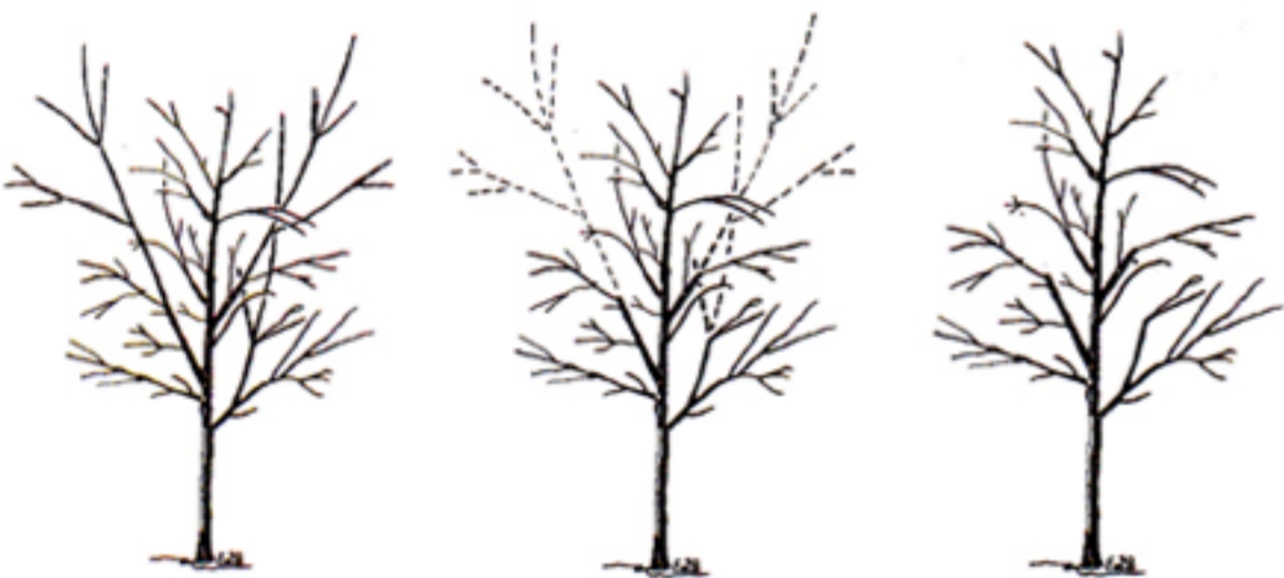
Figure 2. Shorten competing stems to improve structure.

Prune newly planted trees to one central leader by shortening competing stems (Fig. 2). All branches and stems should be shorter than the central leader after pruning is completed (Fig. 2, right).