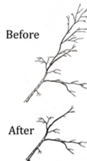
Figure 5. Reduce a stem back to a live lateral to slow its growth.

Reduce or shorten large or long stems and branches back to a live lateral branch (Fig. 5) to slow growth on the pruned branch. This shifts growth to the central leader, creating sound structure.