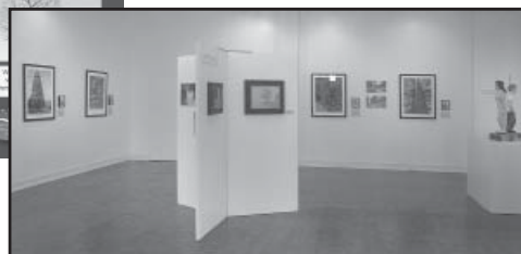
SAGE's Urban Forest Celebration featured works by 15 different artists.