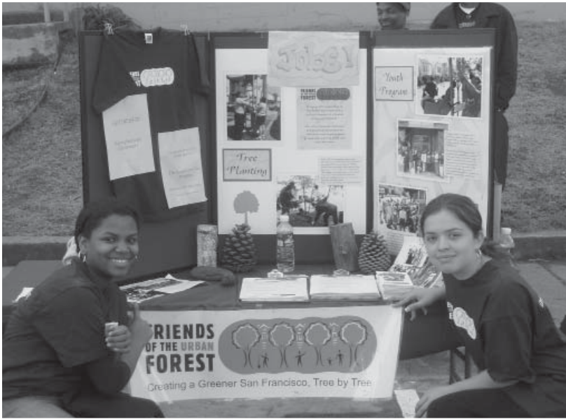
Left: Two Friends of the Urban Forest volunteers recruit other youth during March Gladness.